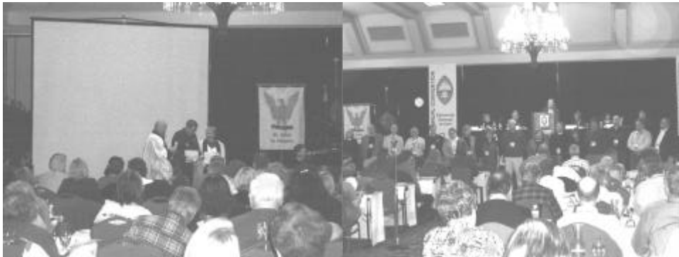
Three Bishops of Utah

The final session, after Saturday lunch, began with a short presentation of Via Media, and a breakout session to give more details of this new program, which will include a DVD for each parish. This will help us to "tell our story" better, and aims to double our membership by 2020. After this, the Bishop presented her appointments and awards to many who have served the Diocese in various ways. All in all, the tone of this Convention seemed to me to be very positive, and much was accomplished.